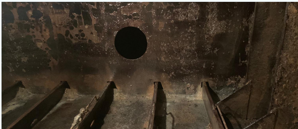
BALLAST TANK COATED IN CPC500