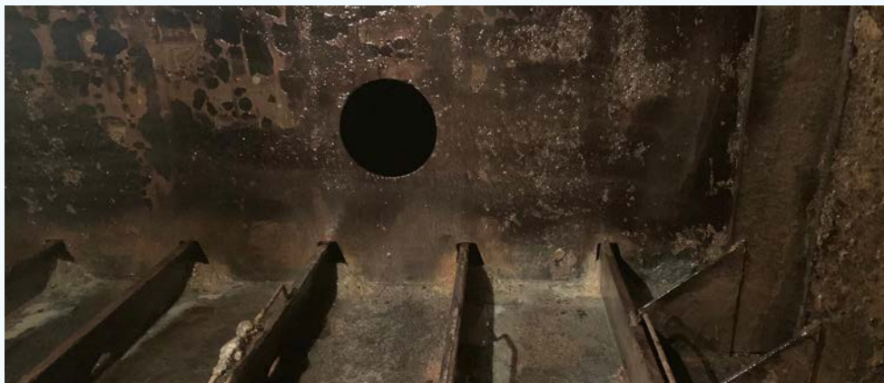
BALLAST TANK COATED IN CPC500